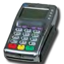
Verifone VX 805 PIN pad.