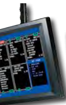
the E-Pos terminal.