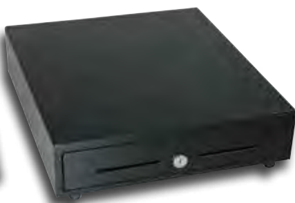
Connect up to eight cash drawers.