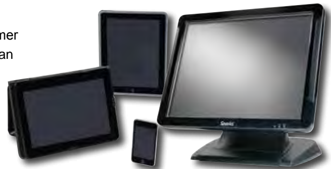
Deploy up to eight POS devices.

You can select a specific customer at the time of sale so that you can track sales levels. You can view either revenue or entire receipts.