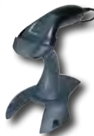
Add a scanner at each POS device.